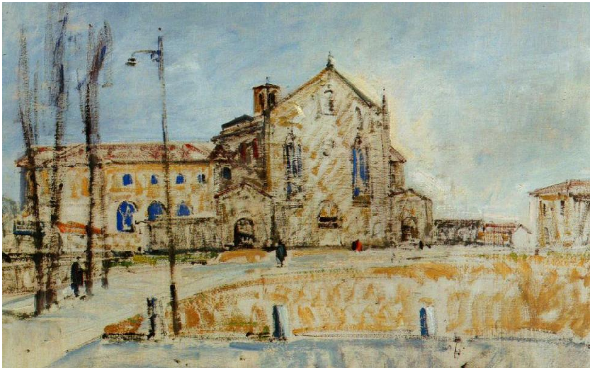
Giuseppe Luzzana – Oil on canvas, 1944 ca.

It is in this context that we frame this year's international conference, which deepens the reflection and discussion already started from the last conferences – The Great Transformation of Work (Bergamo, 6-7 November 2015), The Future of Work: A Matter of Sustainability (Bergamo, 11-12 November 2016) and Industry 4.0: Triggering Factors and Enabling Skills (Bergamo, 1-2 December 2017) – proposed the analysis of the transformation of work from the perspective of professionalism being seen not only as a set of tasks, level of qualification or a characteristic element of a specific group of occupations, but as an extension of one's personal identity, reputation and self-realization. Professionalism serves as a key to a modern organization of work and as a lever for its proper development and recognition. The conference aims to promote an interdisciplinary and comparative debate through the study of various fields (cultural, legal, organizational, economic, social, institutional, etc.) that the new and wider dimension of professionalism calls into question, and it benefits from the contributions of participants from all over the world.