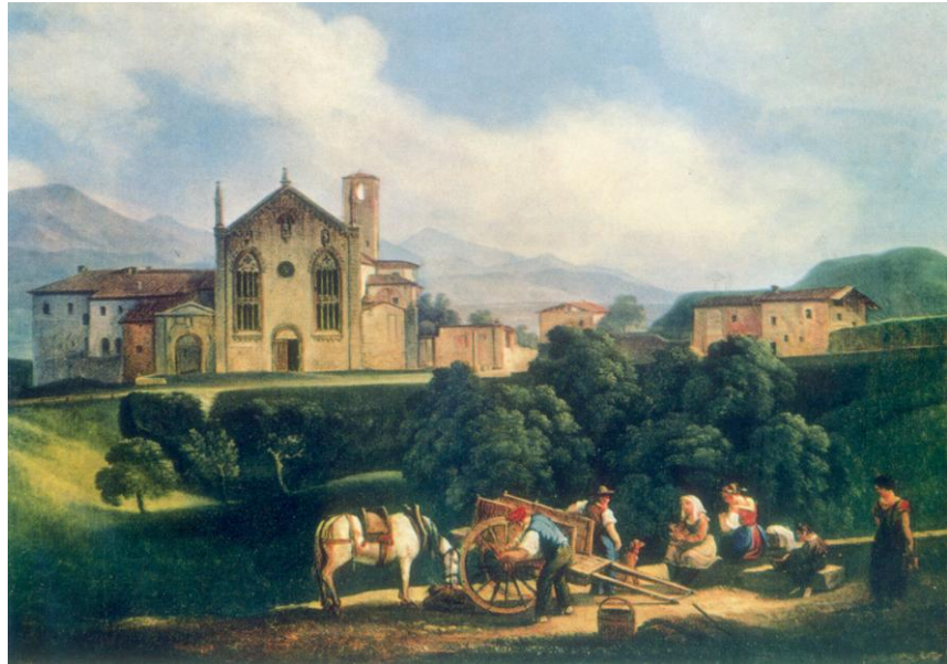
Pietro Maria Ronzoni – Oil on canvas, first half of the 19 th Century

If professionalism acquires a different significance in the new economic and productive paradigm, then it is vital to enhance and protect the skills that comprise and enrich the professional contribution of each worker. Some important areas of reflection are the conditions that enable the de-