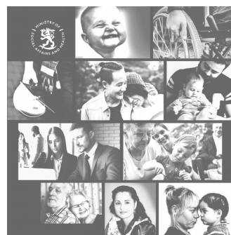
The basic income experiment 2017-2018 in Finland

The basic income experiment 2017-2018 in Finland Ministry of Social Affairs and Health